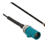
FAKRA to AMC4