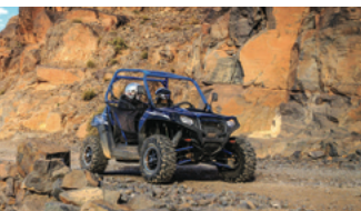
Utility Terrain Vehicles (UTV)