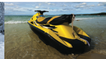
Personal Watercraft (PWC)