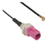
FAKRA to AMC