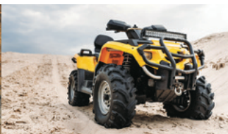
All-Terrain Vehicles (ATV)