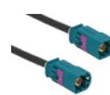
HSD to HSD