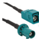
FAKRA to FAKRA