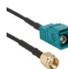
FAKRA to SMA